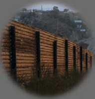
BORDER PATROL & INTERDICTION SUPPORT