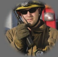
WIDE AREA FIRE OPS CMD & COMM SUPPORT