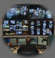
LEO, SWAT & PUBLIC SAFETY