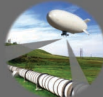
CRITICAL INFRASTRUCTURE MONITORING & BRANDING