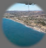
MARTIME PATROL & PORT SECURITY