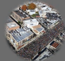
EVENT SECURITY & ADVERTISING